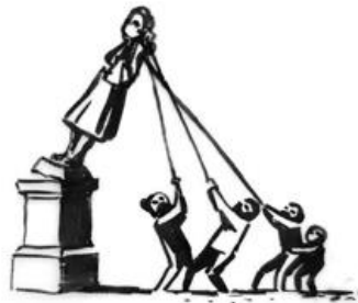
Banksy, Instagram , 2020

Examine Banksy's proposal for what to do with Colston's statue (picture below). What do you think governments should do about monuments representing painful periods of history?