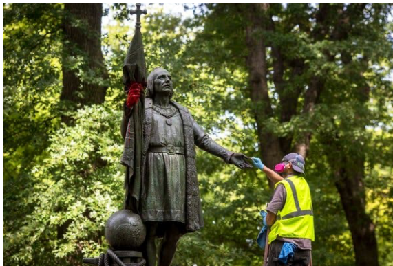
A worker removing the red paint from the hand of a Christopher Columbus statue in Central Park in September 2017.

You have read the following comments on social media about the defacing of this statue. Which one do you agree with? Why?