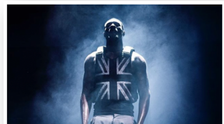
Stormzy's Stab "Proof Vest by Banksy,

Banksy has repeatedly commented on themes of violence and war. Most recently, Banksy designed a Union Jack stab-proof vest that British rapper "Stormzy" wore during his headline set at this year's Glastonbury Festival. "I made a customized stab-proof vest and thought – who could possibly wear this? Stormzy at Glastonbury," Banksy wrote in his